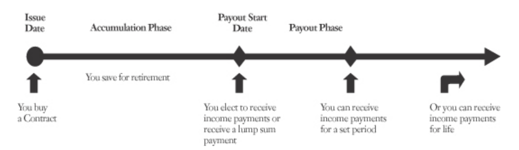
Other income payment options are also available. See "Income Payments."

The timeline below illustrates how you might use your Contract.